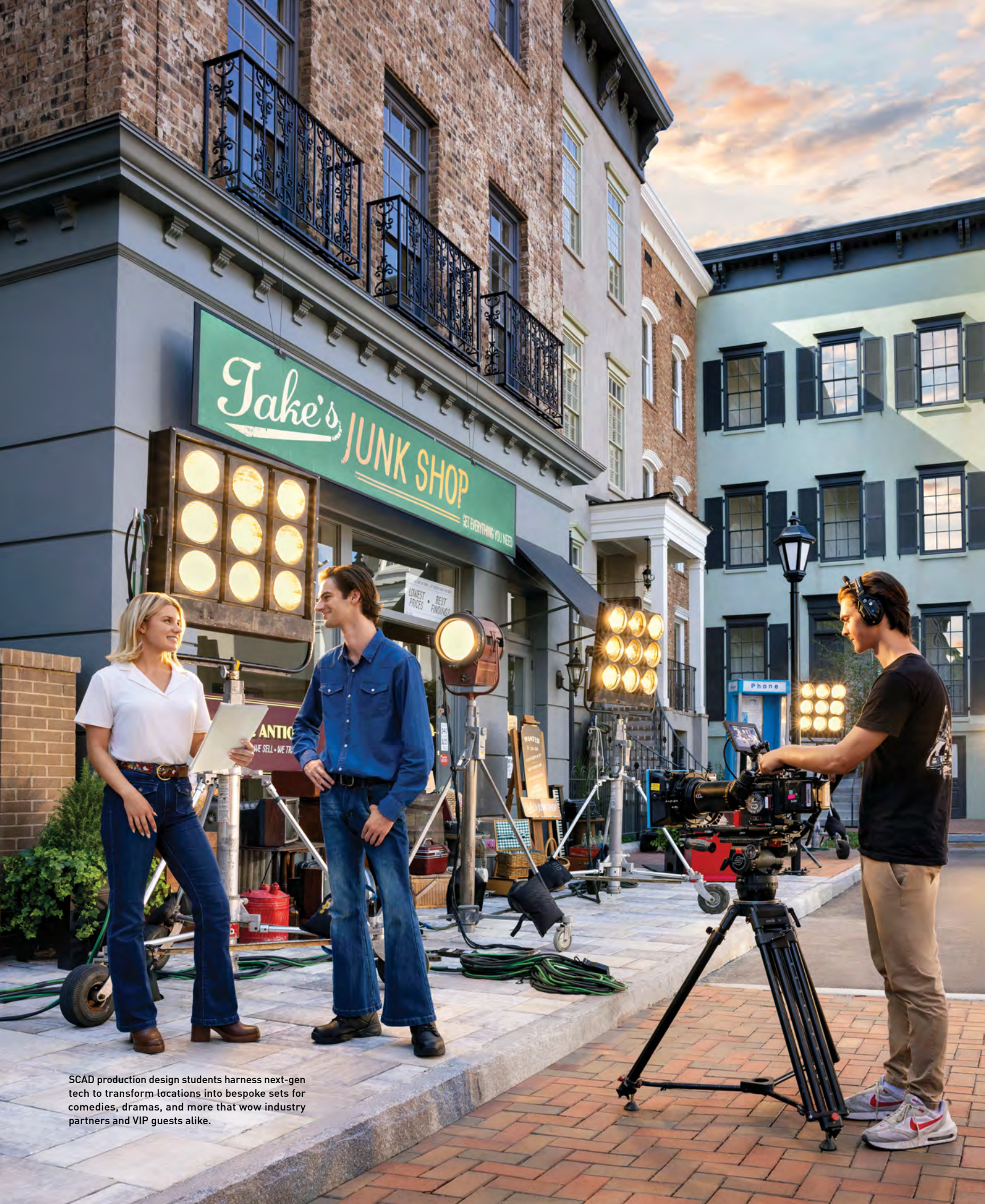
SCAD production design students harness next-gen tech to transform locations into bespoke sets for comedies, dramas, and more that wow industry partners and VIP guests alike.