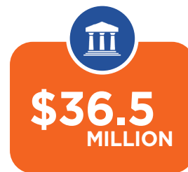
GOVERNMENT REVENUE IMPACT