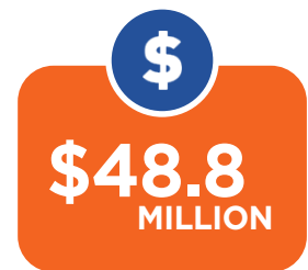
ECONOMIC IMPACT FOR STATE AND LOCAL ECONOMIES DUE TO VISITOR SPENDING