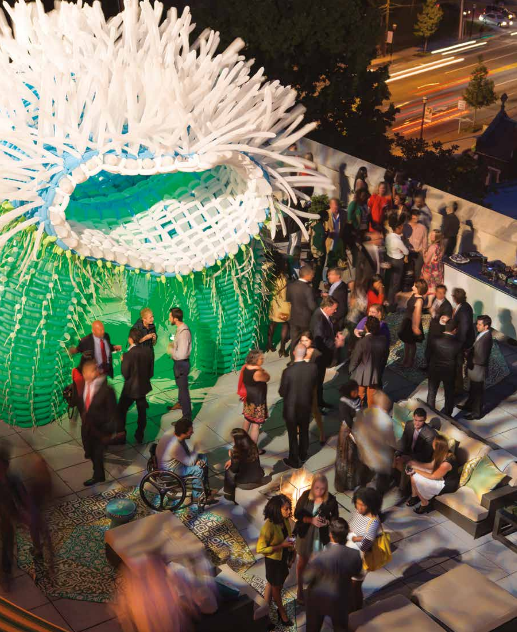
SCAD Atlanta hosted the celebration of yet another remarkable SCAD feat — an unprecedented three consecutive years of No. 1 Design Intelligence rankings for both the undergraduate and graduate interior design programs.